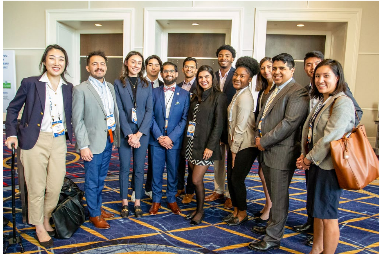
Sidney B. Williams Jr. 2022 Scholars at the 2022 AIPLA Annual Meeting